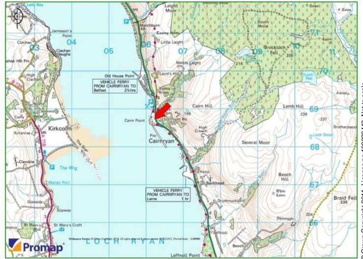
Licence no 100020449. Not to scale