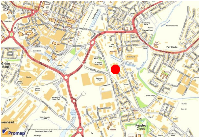
© Crown Copyright 2011. Licence no 100020449. Not to scale