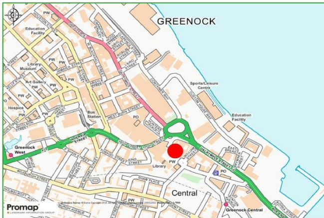
Licence no 100020449. Not to scale